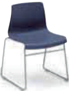
Standard type UCH0007Z 512 · 516 · 755