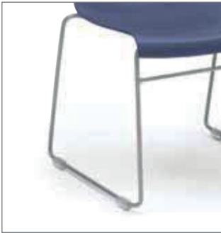
Glide Glides are applied to chair legs to minimize noise and prevent floor scratches.