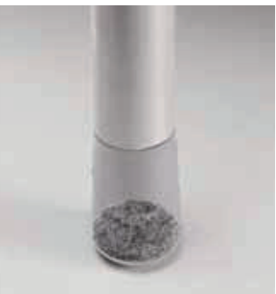
Felt glide Felt glides are applied to minimize noise and prevent floor scratches.

Fursys Education laboratory chairs are made by the largest domestic team of chair specialists. A specialized chair with seat, casters and other functions.