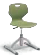
Standard type USH2101Z 420 · 408 · 710

User-friendly lever allows for height adjustment.