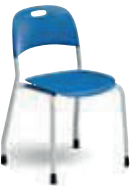
Standard type UCH0005EZ 420 · 482 · 784

Stacking Stacking is possible for both glide and caster types. For caster type chairs, multiple chairs can be stacked and wheeled around easily.