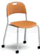
Caster type UCH0005MZ 418 · 479 · 784