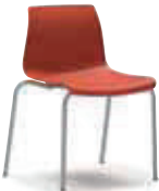
Frame type UCH0007EZ 460 · 460 · 750