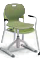
Armrest, standard type UCH0005AFEZ 541 · 490 · 785