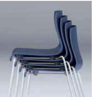
Stacking Chairs can be stacked for easy storage and space efficiency. (4~5 chairs may be stacked)

Stylish modern design with smooth finish. The seat and backrest-in-one chair is ergonomically designed to create comfortable, stylish seating.