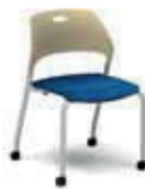
Caster type UCHN0001MZ 513 · 487 · 780