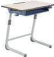
Adjustable desk height USD2202M 700 · 500 · 640 USD2203M 700 · 500 · 700

※ This image may differ to actual product. Please refer to color chart.