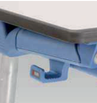
Bag hanger A PP (polypropylene) protruding bag hanger ensures user safety.