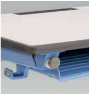
Urethane edge The polyurethane molded edge on desk surface ensures user safety and product durability.