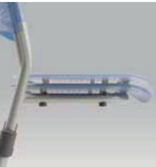
Adjustable height Height can be adjusted at three different levels (40 mm each) according to user height.