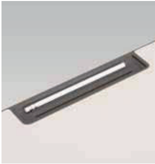
Pen holder A convenient pen holder on the desk surface stores writing tools. the desk surface adds convenience.