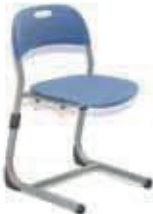
Adjustable chair height USH2202MZ 442 · 452 · 693 (Seat height 380) USH2203MZ 442 · 472 · 741 (Seat height 420)