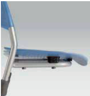
Forward tilt-able seat (Tilt-able chair) Forward tilting function (7.5°) helps create an optimal sitting position by allowing a student to maintain the natural S - shape of his or her spine.