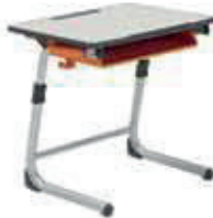
Tilt-able desk USD3202M 700 · 500 · 640 USD3203M 700 · 500 · 700