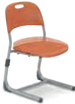
Tilt-able chair USH3202MZ 442 · 452 · 693 USH3203MZ 442 · 472 · 741