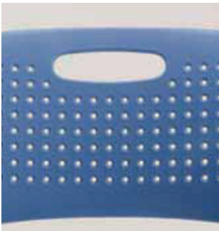
PP backrest An ergonomically designed PP (polypropylene) backrest provides back support and ventilation for comfortable sitting.