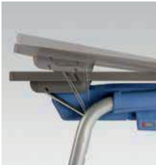
Tilt-able desk surface Desk surface can be tilted (11°) to the desired angle according to class format and user's posture.